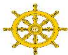
The Eight-Forward dharma wheel

There is no single Buddhist symbol, but images have evolved that represent Buddhist beliefs.