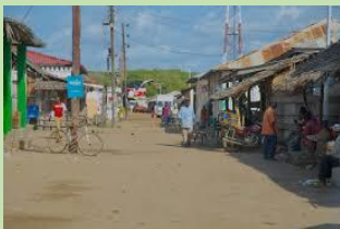
Kenya a country in the continent of Africa.