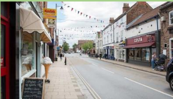
Cottingham in Hull, England is a large village.