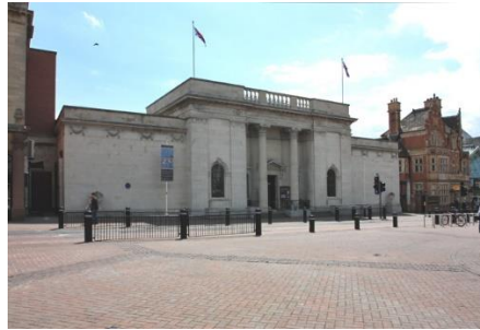
Ferens Art Gallery, Hull