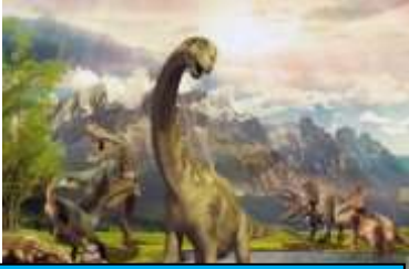
Dinosaurs Roamed the Earth