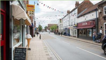
Cottingham in Hull, England is a large village.